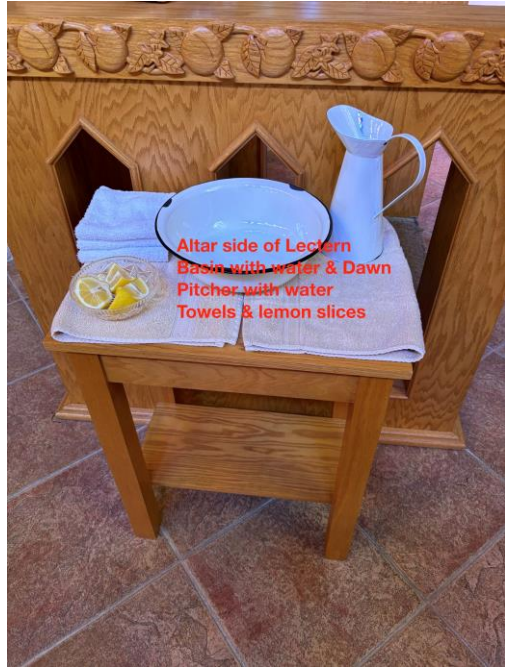
Altar side of Lectern Basin with water & Dawn Pitcher with water Towels & lemon slices