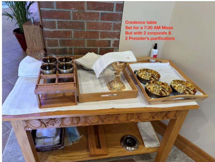
Credence table Set for a 7:30 AM Mass But with 2 corporals & 2 Presider's purificators