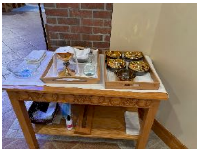
Page 3 of 4