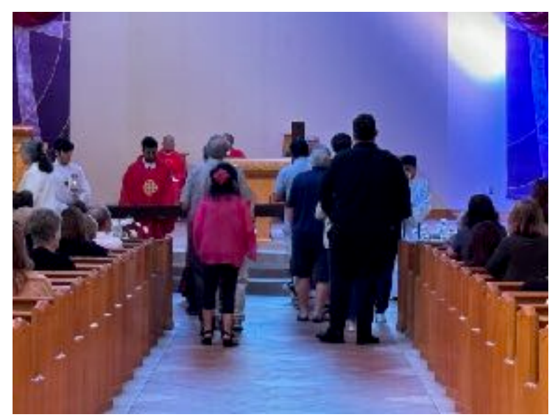
Page 4 of 4